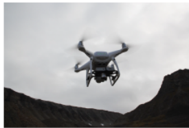
Standard consumer-level UAS drone (DJI Phantom 2 Pro) with additional payload.